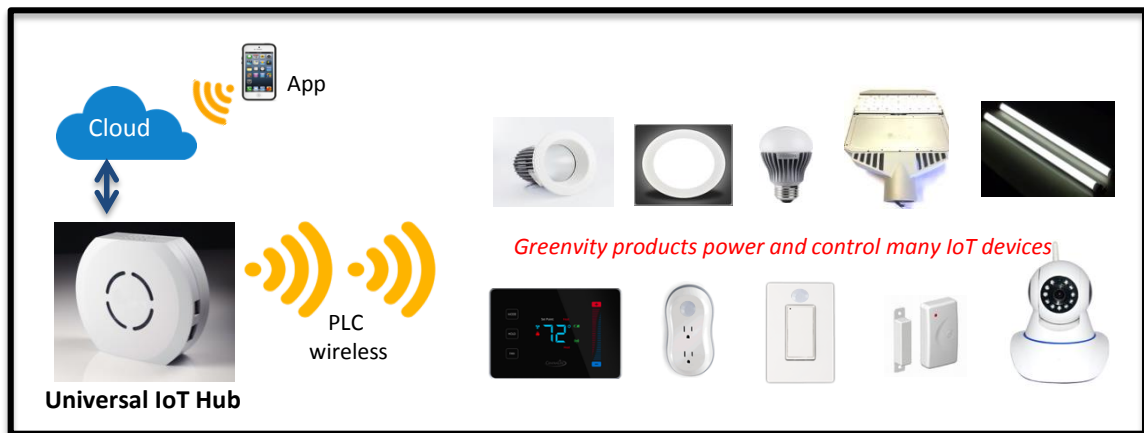
Smart LED Lighting Control with Sensor Network

For more information, please contact Greenvity